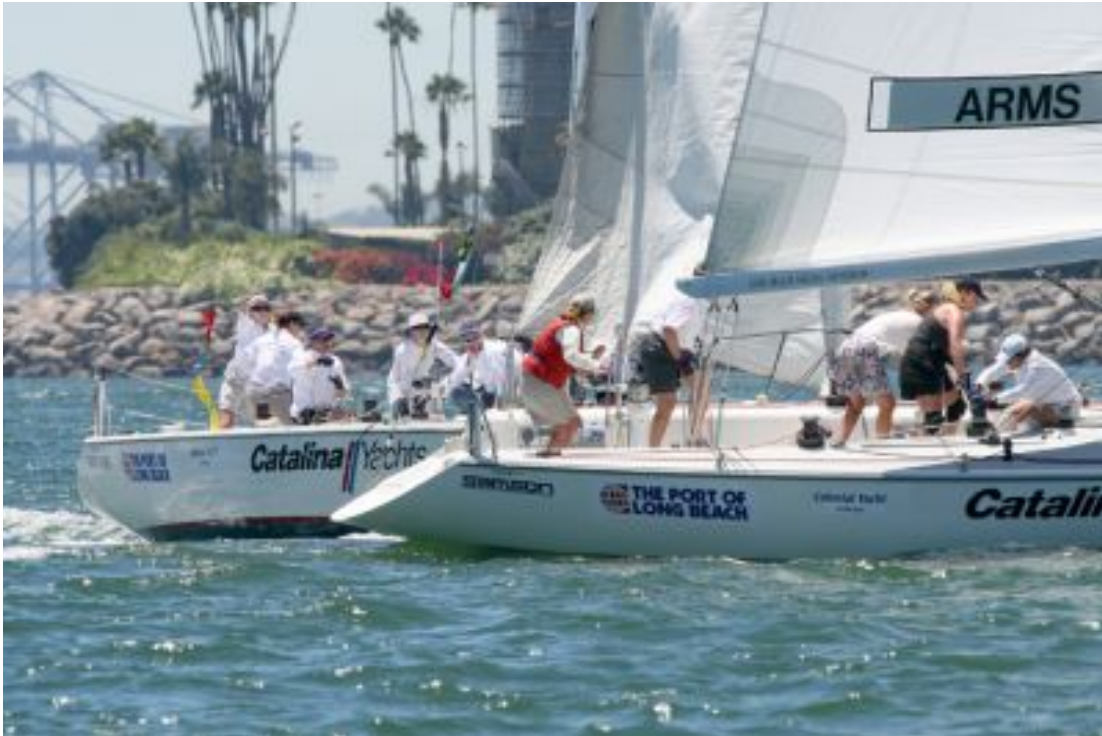
Arms (orange red jacket – foreground boat) was also a competitor in the second annual Mayor's Cup race, held July 14-15 in Long Beach, CA.

The Mayor's Cup included eight of the world's top women sailors and their crews from the U.S., France, Australia and Brazil in a series of 14 match races. Arms and her crew finished with seven wins and seven losses and earned a 5 th place finish. French skipper Claire Leroy had a 12-2 record for the top prize.