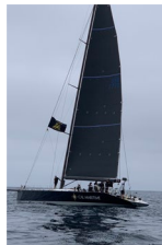
Sailing Coach - TBA