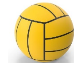
Men's & Women's Water Polo Coach - TBA