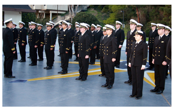
NAVAL SCIENCE MINOR Please refer to the Minor Requirements.

http://www.csum.edu/web/admissions/militaryoptions